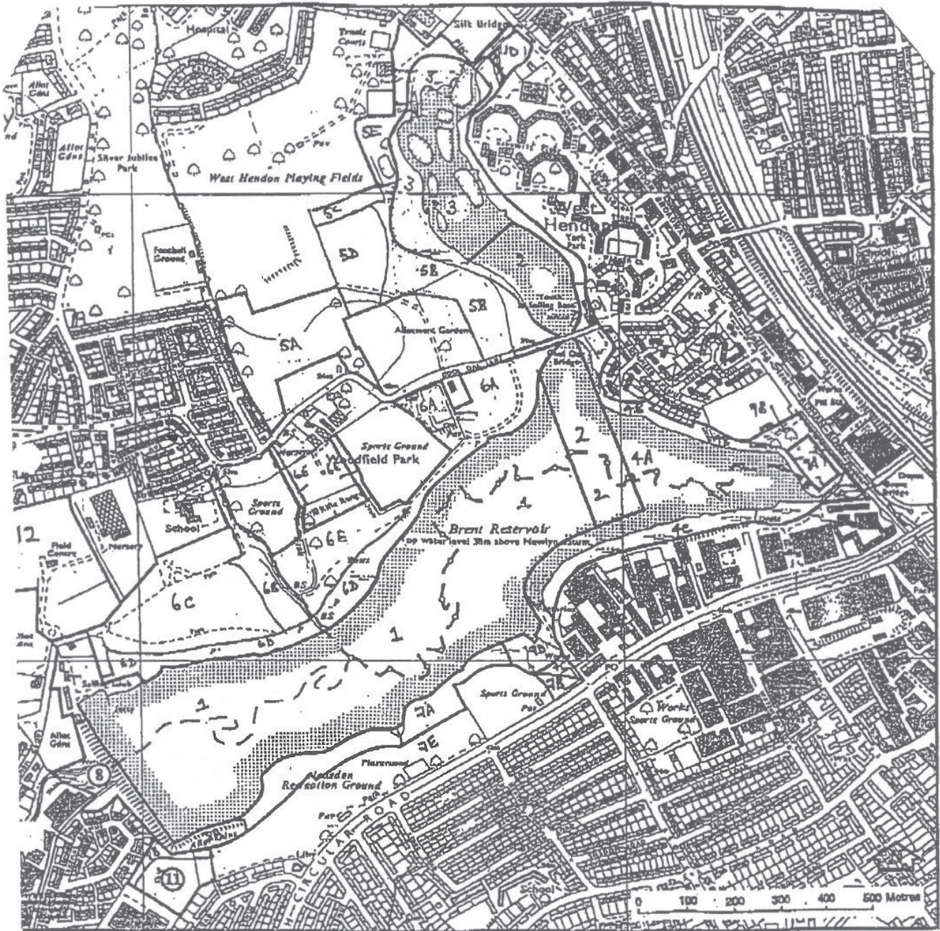
Welsh Harp Reservoir: Management Plan Zones Map